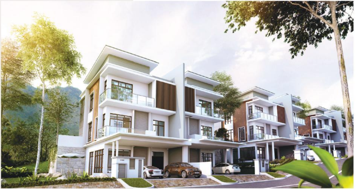
26 SEMI-DETACHED UNITS

Soothe your mind and stimulate your senses amidst the charming lush surrounding.