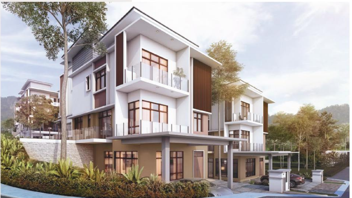
6 BUNGALOW UNITS